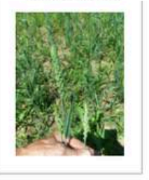
Yellow Spring Wheat