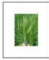
Swedish Spring Wheat

THESE VARIETIES, 8 ROW FLINT CORNS, AND MORE ARE A PART OF OUR AMBITIOUS RESTORATION PROGRAM