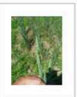
Amy Spring Wheat