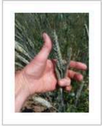
Hulless Black Emmer