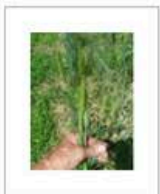
ND Spring Wheat