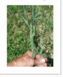
Purple Spring Wheat