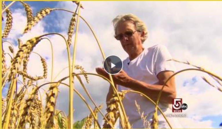
Chronicle, ABC -Boston : Embrace the Grain