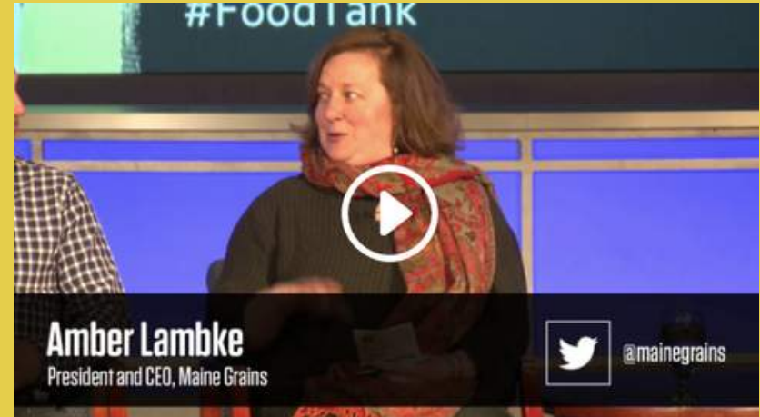
Food Tank: Building Innovative Food and Agriculture Alliances